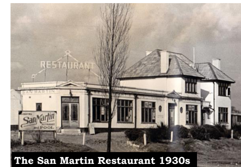
The San Martin Restaurant 1930s