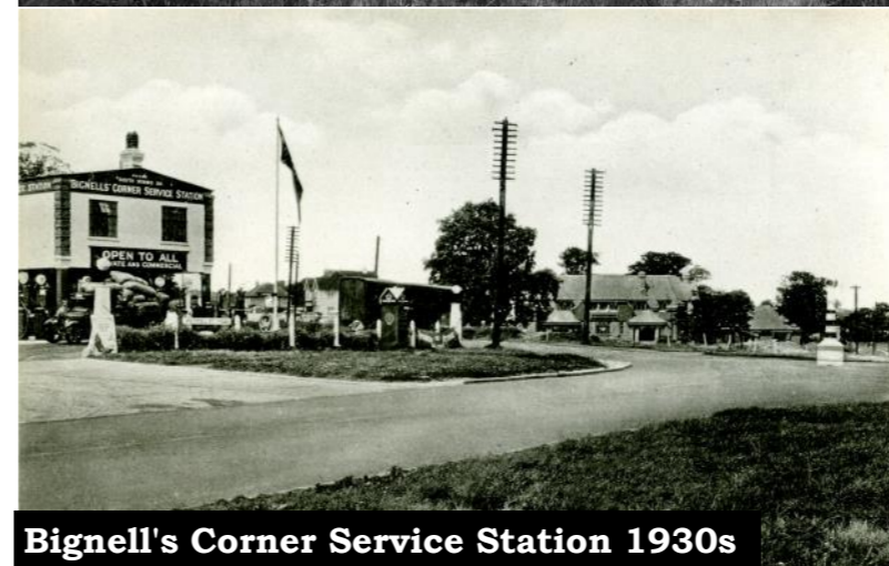
Bignell's Corner Service Station 1930s