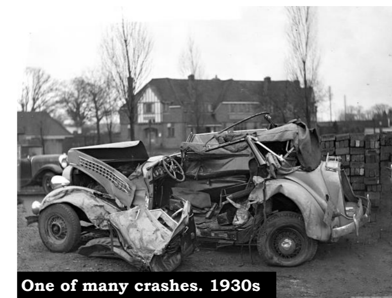
One of many crashes. 1930s