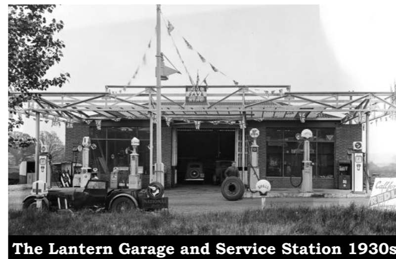
The Lantern Garage and Service Station 1930s