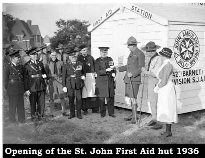
Opening of the St. John First Aid hut 1936

The 1935 map opposite shows. The San Marina also called San Martin restaurant with an outdoor swimming pool, The Middlesex Arms public house, hotel and restaurant, Bignell's Corner Service Station. petrol and repairs, The Beacon Café transport café, Lantern Garage petrol and repairs The Rest transport café, The Five Bells restaurant and finally WM Bignell and Son nurserymen.